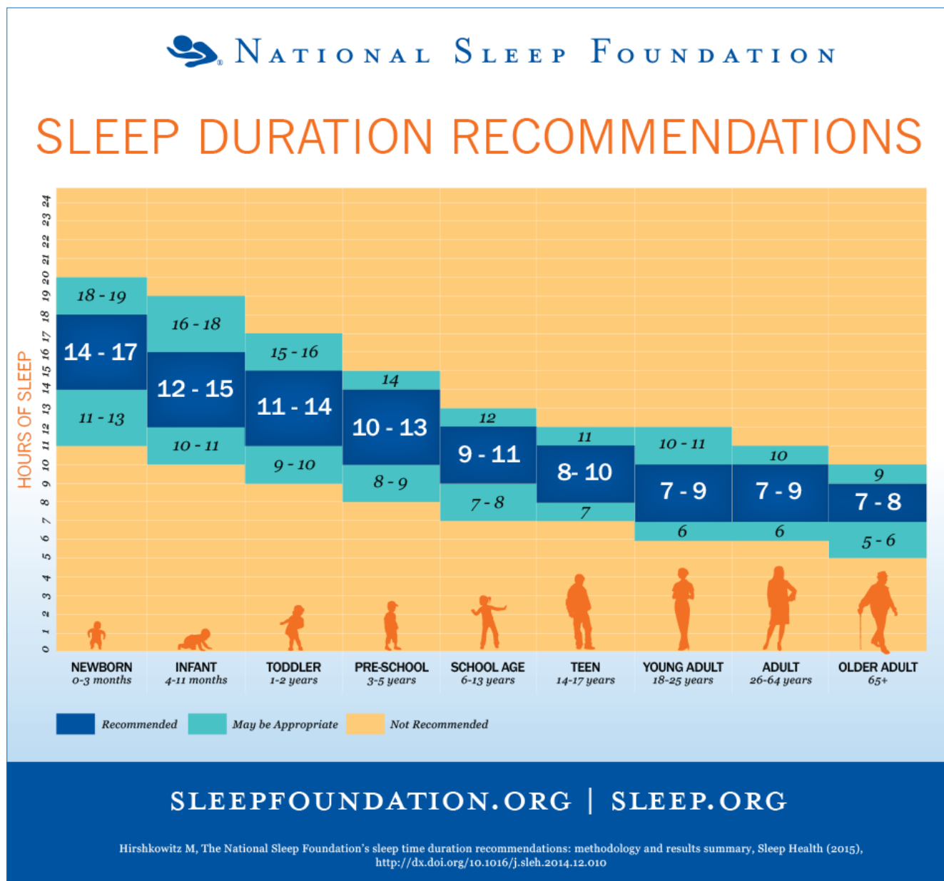
Table 1: Sleep recommendations by age